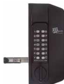
BL3150 BTB Keypad/Lever BL3151