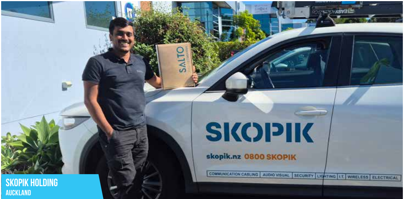
SKOPIK HOLDING AUCKLAND

Ravi from Skopik Holding is excited to showcase their newly purchased Salto advanced access control solutions, ready to be installed for their commercial clients. They're committed to delivering cutting-edge security systems—and Salto is a perfect fit for their growing portfolio.