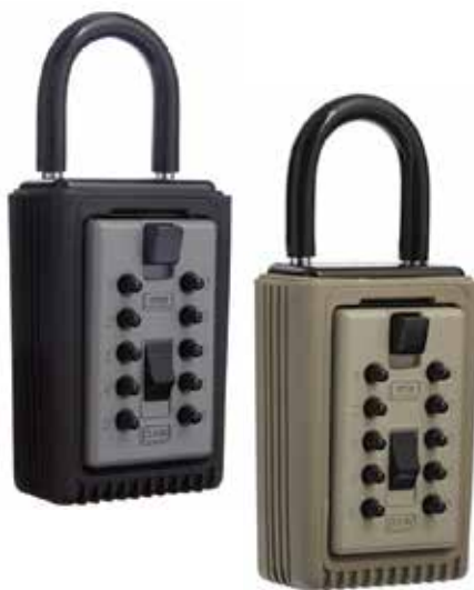
KIDDE Keysafe C3, 3 Key Capacity

001360 White SU1360 001361 Clay SU1361 001361 Titanium SU1365