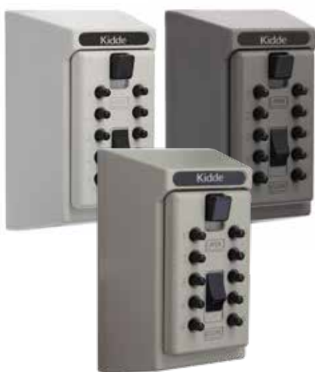
KIDDE Keysafe S5, 5 Key Capacity

001360 White SU1360 001361 Clay SU1361 001361 Titanium SU1365