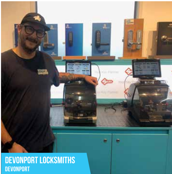
DEVONPORT LOCKSMITHS DEVONPORT

Ravi from Skopik Holding is excited to showcase their newly purchased Salto advanced access control solutions, ready to be installed for their commercial clients. They're committed to delivering cutting-edge security systems—and Salto is a perfect fit for their growing portfolio.