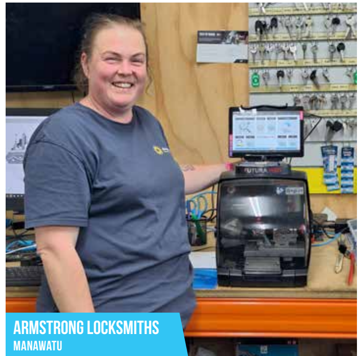
ARMSTRONG LOCKSMITHS MANAWATU