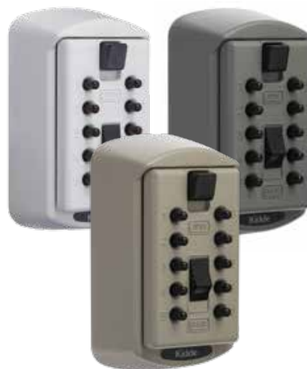
KIDDE Keysafe S6, 2 Key Capacity

001350 Clay Padlock SU1350 001192 Titanium Padlock SU1192