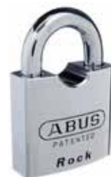
ABUS 83/80 Series Security Level 4 (SL4)