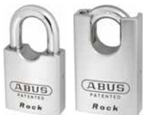
ABUS 83/55 Series Security Level 3 (SL3)

When that high security job or Government installation requires high security padlocks, it's time to use an ABUS 83 series solid hardened steel body version. The models below are SEEPL Certified for use in Australian Government facilities.