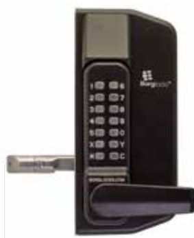
BL3400 Keypad/Lever BL3400MGPROECP