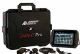
SMART PRO Programmer

Offer strictly valid until 30th June, 2025. Not available in conjunction with other offers.