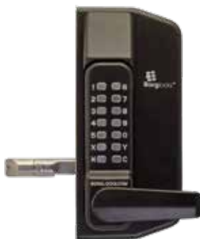
BL3430 BTB Keypad/Lever BL3430MGPROECP