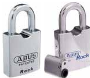
ABUS 83/60 Series Security Level 3 (SL3)