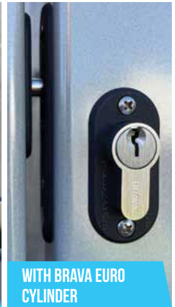
WITH BRAVA EURO CYLINDER

Visit lsc.co.nz or talk to your Account Manager for more details.