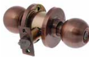
Metro Entrance Knob Antique Copper