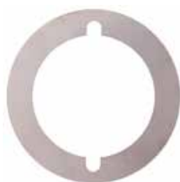
BDS Scar Plate suit EV 8000 O/D 85 mm BDSFS8000