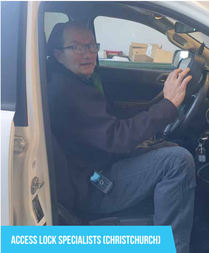
ACCESS LOCK SPECIALISTS (CHRISTCHURCH)