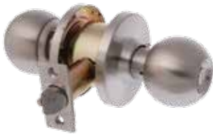
Metro Entrance Knob Stainless Steel