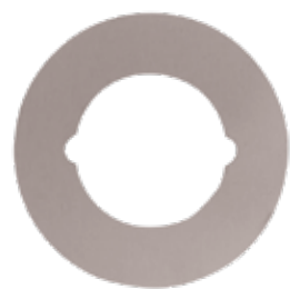
BDS Scar Plate suit 3000 O/D 98 mm BDSFS3000