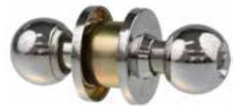
Metro Entrance Knob Polished Stainless Steel