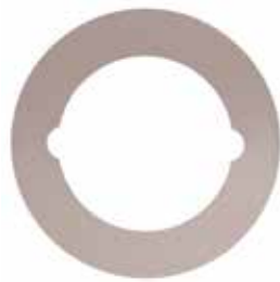
BDS Scar Plate suit 530 O/D 83 mm BDSFS530