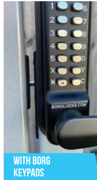
WITH BORG KEYPADS