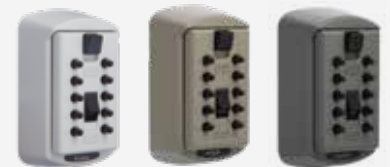
KIDDE Keysafe S6, 2 Key Capacity

001350 Clay Padlock SU1350 001192 Titanium Padlock SU1192