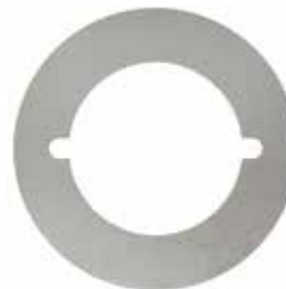
BDS Scar Plate suit EV 8000 O/D 98 mm BDSFS800098