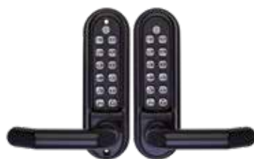
Digital Lock 5051 M/Grade Pro Black Lever/Lever BTB ECP