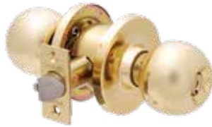
Metro Entrance Knob Polished Brass