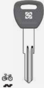
AB114P ABUS Bike locks