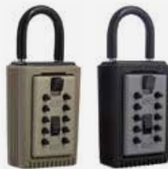
KIDDE Keysafe C3, 3 Key Capacity

001360 White SU1360 001361 Clay SU1361 001361 Titanium SU1365