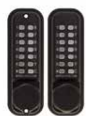
Digital Lock 2621 M/Grade Pro Lever/Lever BTB ECP