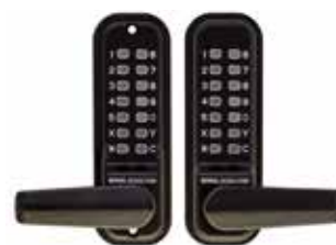
Digital Lock 4441 M/Grade Pro Lever/Lever BTB ECP