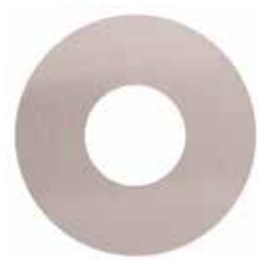
BDS Scar Plate suit 201 O/D 70 mm BDSFS201