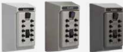
KIDDE Keysafe S5, 5 Key Capacity

001360 White SU1360 001361 Clay SU1361 001361 Titanium SU1365