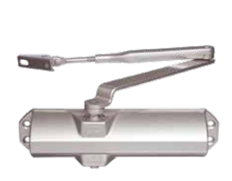
TS68 EN2-4 Door Closer

Whether for private homes or contemporary office buildings, door closer systems from dormakaba are intelligent, integrated access solutions that combine consistency, convenience, design and premium quality. The wide-ranging product portfolio satisfies a broad spectrum of functional requirements and thus offers solutions for almost any individual door situation.