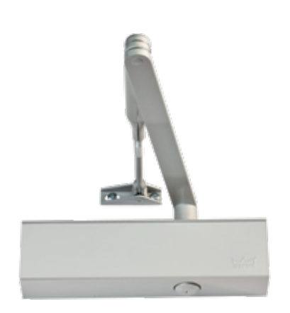
TS73 EN1-4 Door Closer