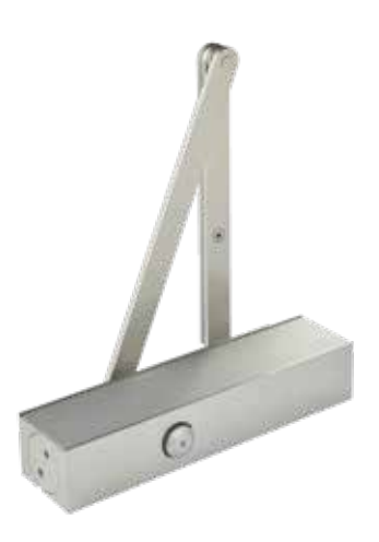
TS83 EN3-6 Door Closer