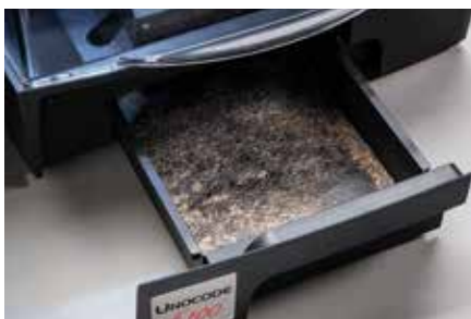
New design keeps your workshop clean