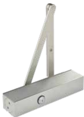
TS83 EN3-6 Door Closer TS8300

Whether for private homes or contemporary office buildings, door closer systems from dormakaba are intelligent, integrated access solutions that combine consistency, convenience, design and premium quality.