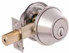
Urban Deadbolt D362 Stainless Steel Double Cylinder Boxed D362B