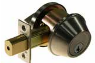
Metro Deadbolt BP200LI Single Cylinder 60MM Satin Stainless Steel BP200LISSS

BRAVA Urban double cylinder deadbolt series are suitable for domestic or commercial applications. Compatible to most restricted key systems.