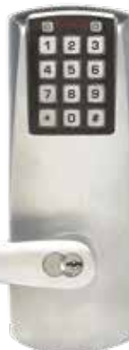
E-Plex 2000 E2031XSL62641 (Cylindrical), E2070XSL62641 (Mortice)