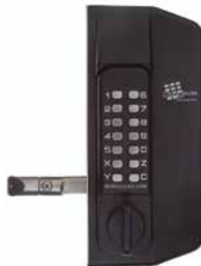
3150 BTB Keypad Lever