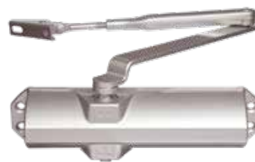
TS68 EN2-4 Door Closer TS6800

Specifically for interior doors - also fire and smoke protection doors, the Dorma TS 73 proves to be the universal solution for doors of different design and construction. Due to the extremely flat, compact design, there are virtually no installation problems. Tried and trusted quality is your assurance of reliability.