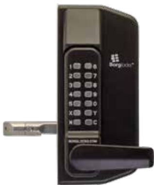
3430 BTB Keypad Lever