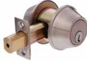
Metro Deadbolt BP210LI Double Cylinder 60MM Satin Stainless Steel BP210LISSS