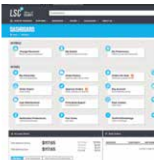
Updated dashboard for simple account management

CarLab, your ultimate resource for everything auto just got better