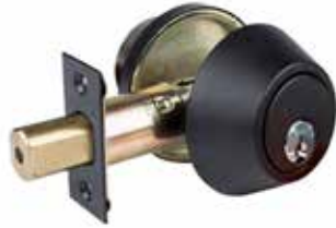
Urban Deadbolt D3X92 Matt Black Double Cylinder Boxed D3X92B