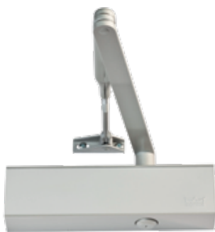
TS73 EN 1-4 Door Closer TS7300V

Decades of experience have gone into the development of the Dorma TS 83 door closer. The result is user convenience coupled with outstanding versatility. It can be adjusted to suit almost all types of door. The Dorma TS 83 can even be supplied with additional anti-corrosion protection for exposed applications or aggressive conditions.