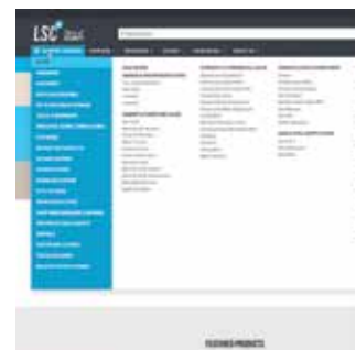
New mega-menu for improved navigation