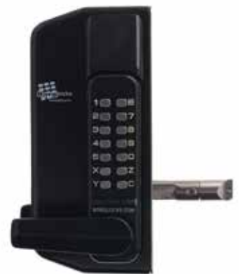
3430 BTB Keypad Lever