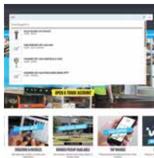
Find the right product quickly with in-search product suggestions