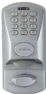
E-Plex 1500 E150262641